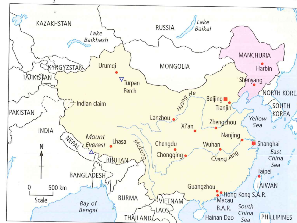
Map of China in 1900.

court. It was also the peasants who faced starvation during floods or droughts, as their subsistence farming techniques often left them with barely enough to feed their families. The population in China grew by 8 per cent in the second half of the 19th century, but the land cultivated only increased by 1 per cent. This imbalance made famines more frequent. Peasants' plots of land were reduced, although at the same time landlords increased rents; some peasants had to pay 80 per cent of their harvest. Peasants would be driven to the cities by poverty, where there was already high unemployment due to improved technology and cheap Western imports.