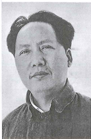
Mao Zedong, the communist victor of the Chinese Civil War.

As you read this chapter you need to focus on the following essay questions: