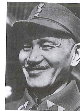
General Jiang Jieshi, leader of the nationalist forces.

After the death of Sun, a general took over leadership of the GMD, General Jiang Jieshi. Jiang was a committed nationalist, and had enthusiastically joined the GMD. He had had military training before World War I in Japan, and then in the USSR. Indeed, the Soviets had begun to invest in the GMD, providing aid and assistance to the party. The Soviets believed they could foster good relations with a nationalist China. As well as the GMD, another revolutionary party emerged during the warlord period, the Chinese Communist Party (CCP). This communist party was officially set up in 1921. Initially, its membership was mainly intellectuals, and it had no real military strength. It was due to this weakness, and some shared aims, that the CCP agreed to work with the GMD. It was also consistently encouraged to cooperate with the nationalists by the USSR.