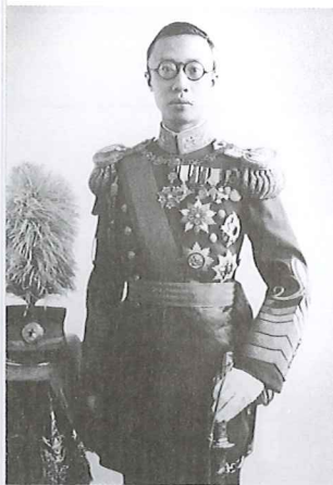
Pu Yi, the Chinese Emperor from 1908 to 1912.

In November 1911, in an attempt to seize the political initiative, delegates from the 'independent' provinces gathered in Nanjing to declare the creation of a Chinese Republic. A political exile, who had been in the USA during the revolution, was invited to be China's first President – Dr Sun Yixian.