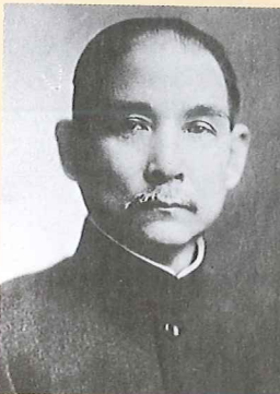
Dr Sun Yixian

Sun Yixian was the inspirational leader of the Nationalist GMD. He wanted to modernize China by adopting Western political and economic methods. His anti-Manchu government views had led to his exile in Japan. Sun put together his ideas for the future of China in the form of the Three Principles of the People: Nationalism, Democracy and the People's Livelihood (economic reform and land redistribution). Sun was specific about Chinese nationalism as focused against imperialism, and in his view Chinese democracy would not copy that of the West. For China, the key was not the struggle for personal freedom, but for national freedom.