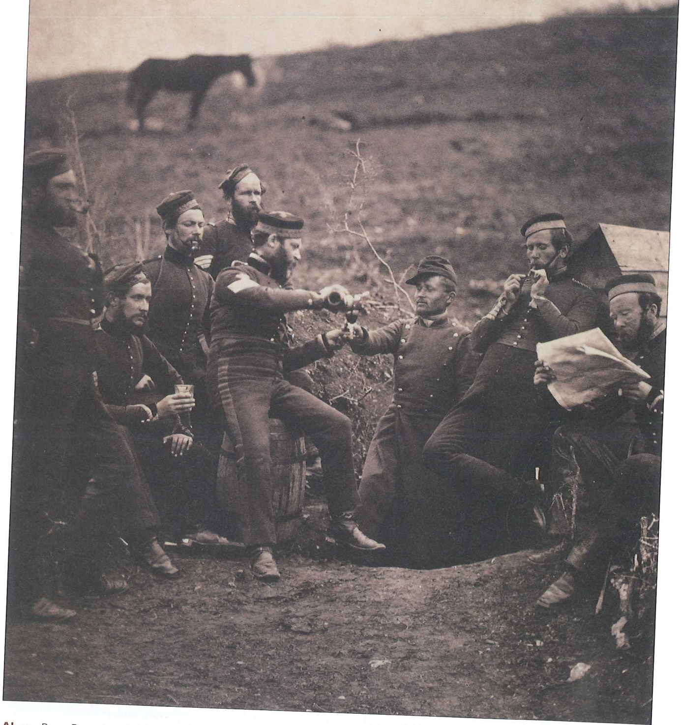
Above: Roger Fenton's photograph entitled 'Entente Cordiale'. He depicts the NCOs and men of the 4th Dragoon Guards as clearly well dressed and well fed. One of them is offering a glass of wine to a visiting French soldier: What do you think explains the slight fuzziness of the photo?

“ Insofar as Britain had entered the war for fear of the Russian ‘Bear’ taking over Constantinople and then menacing the Indian Empire, these fears were allayed ”