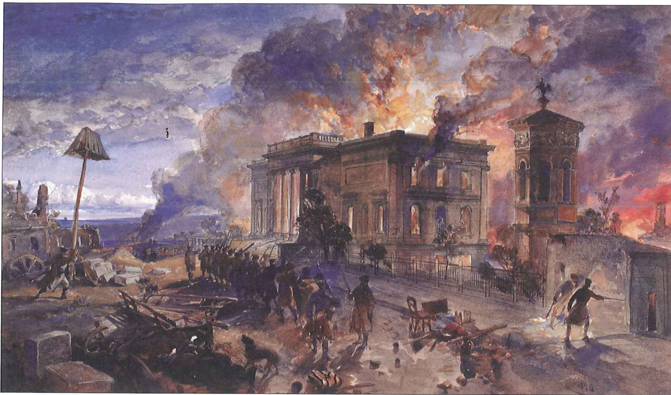
Above: Sebastopol in Flames, 1856. It had taken a year, rather than the expected three months, for the British and French to take the Russian naval base. Paintings like this were still popular, especially given the limitations of photographic techniques.

was almost incredulous that the miserable beggar who wandered the streets of London 'led the life of a prince compared with the British soldiers who were fighting for their country'. The army's aristocratic officers came in for sustained invective.