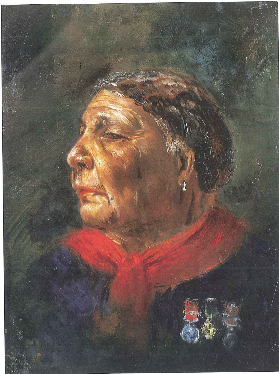
Left: Mary Seacole (c. 1815-81). Racial prejudice in London denied her the official position of nurse, but she did sterling work in the Crimea. W.H. Russell praised her as 'a kind and successful physician' who 'doctors and cures all manner of men with extraordinary success'.

support. Finally the mantle fell on Lord Palmerston. But he was over 70, and according to Disraeli was 'very deaf, very blind, and with false teeth, which would fall out of his mouth when speaking, if he did not hesitate so in his talk': ginger beer rather than champagne. Could he survive? Everything depended on the war. The news that Sebastopol had fallen in September cemented his position, and he won the next election, in 1857. The political change wrought by the war was therefore muted.