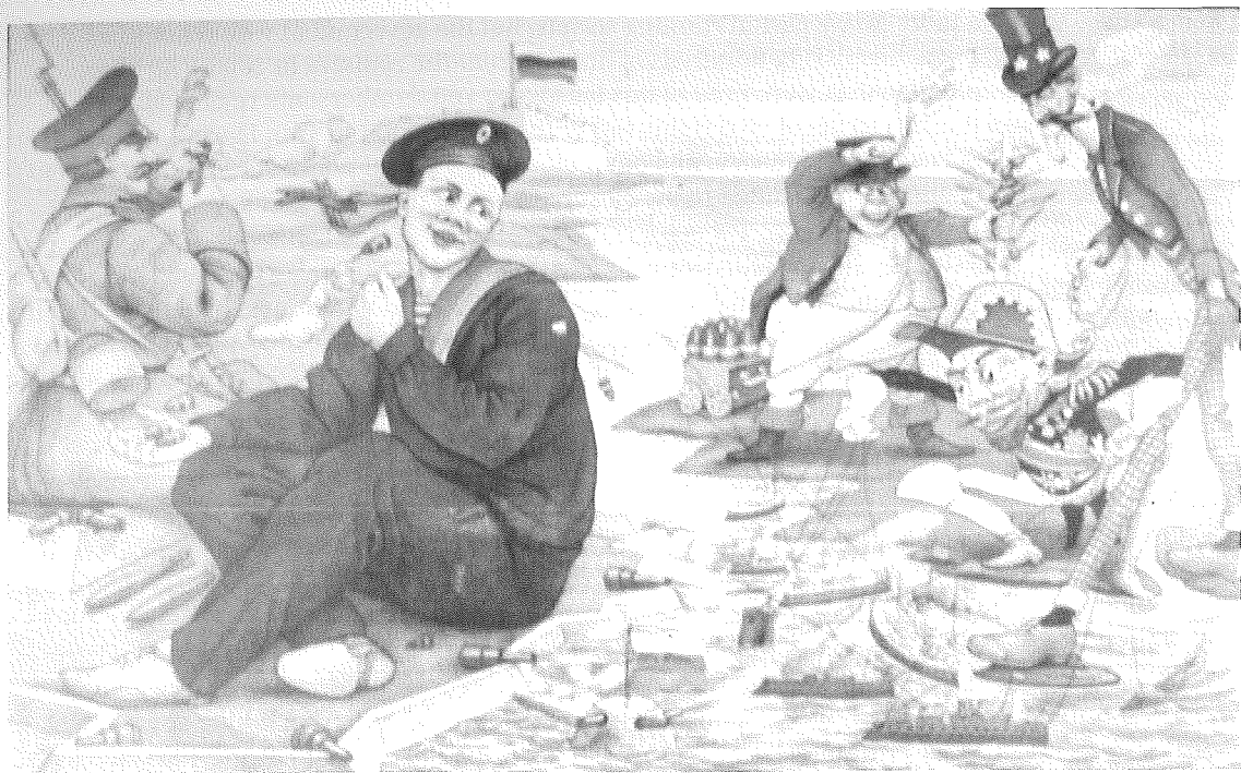
SOURCE 2.2 A cartoon drawn during the Russo-Japanese war. The sailor is saying: 'Oh you funny Japs, always making mistakes. Thank you for the badly aimed shells which help me light my pipe!'