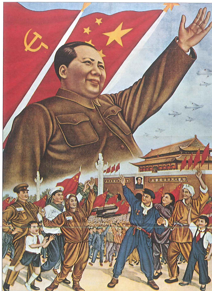
Above: This poster from 1949 celebrates the Communist victory in the long civil war. Mao decided that 1 October was 'National Day'.

danger to Soviet Russia was largely theoretical by the time that Stalin came to power, China had suffered from decades of direct and devastating foreign intervention by the time Mao took control. As a result, Stalin had actively to stoke the flames of nationalist fervour in a way that Mao never found necessary.