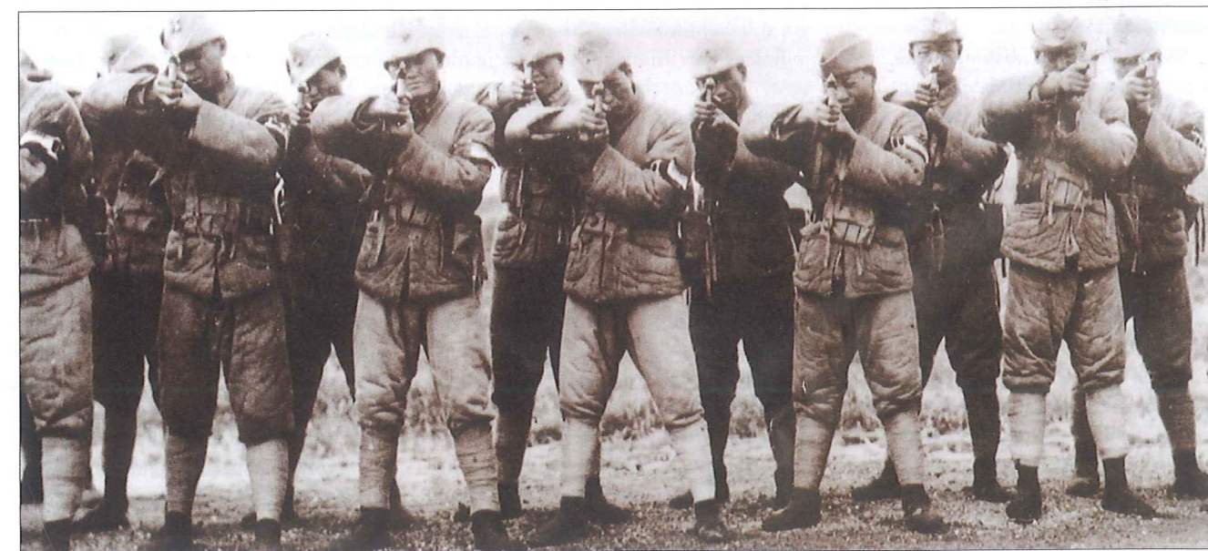
Above: The Nationalist troops of Chiang Kai-shek, armed with Mauser pistols, during their successful seizure of Shanghai in 1927. The KMT was tainted with American support, and therefore Mao, unlike Stalin, had no need to magnify the foreign threat.

In marked contrast to Stalin, and in exactly the same year that the Five Year Plans were announced, Mao defined himself as the ally rather than as the enemy of the peasantry. Like Stalin, Mao came from a peasant family, being born in the agricultural Hunan province of China in 1893, and was a highly intelligent autodidact. However, unlike Stalin, Mao had grown up in a family which was both stable and comparatively prosperous. Moreover, as a young revolutionary he completely disagreed with the Bolshevik view that the proletariat was the key to communist revolution, arguing that 'The peasants are the sea. We are the fish. The sea is our habitat'. Mao put his beliefs into practice following the attack