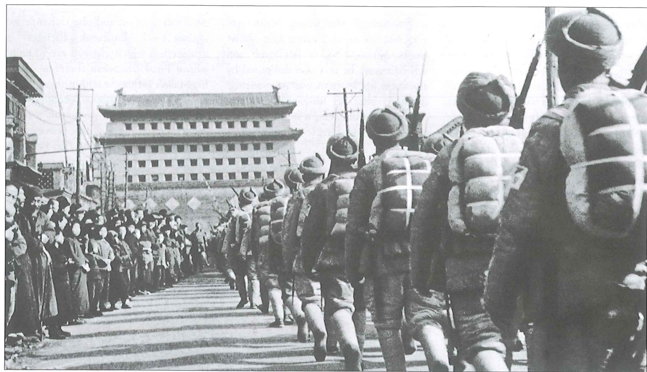
Above: Mao's victorious Red Army enters Beijing on 31 January 1949.

on the communists by Nationalist forces in the 'White Terror' of 1927. Fleeing to the agricultural province of Jiangxi, he proceeded to forge strong links with its 3 million peasants, who, in the words of the Red Army General Peng Dehuai, 'dug up from the ground the grain which they had hidden from the KMT troops and gave it to us'. The peasants welcomed Mao's focused, peasant-based revolutionary programme during this period and responded enthusiastically to the declaration of the short-lived 'Socialist Republic' in 1931.