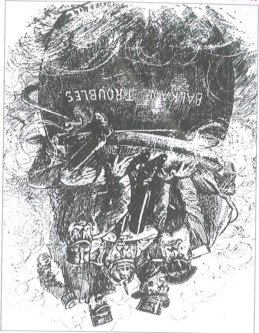
Above: This illustration from Punch in 1908 depicts the nations of Europe scarcely able to keep the lid on the 'Balkan Troubles'. Was a major conflict inevitable sooner or later?

that preserving peace was essential to the maintenance of economic prosperity, social stability, and political institutions. In spring 1914, Peter Durnovo, a Russian conservative, warned Nicholas II that a war between Russia and Germany would bring about revolution. Helmuth von Moltke, victor at Sedan, warned the Reichstag in 1890 that the next general European war would be akin to a Thirty Years' War. Very few statesmen or soldiers believed that the next war would be short. For statesmen, at least, this induced caution. Moreover civilian governments were able to keep control over their military men in deciding on questions of war and peace. General staff officers in Vienna and Berlin regularly called for preventive war, but found themselves blocked by resolute ministers. On one