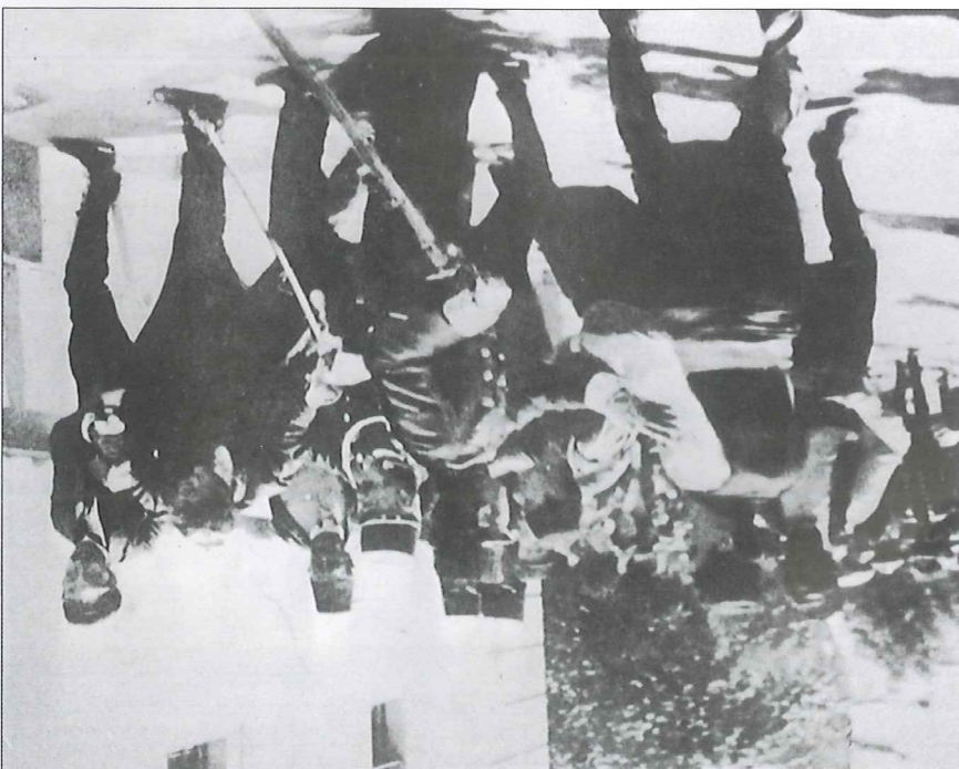
Above: The arrest of Gavrillo Princip, 28 June 1914. Why did the assassination of Franz Ferdinand unleash issues of momentous importance?